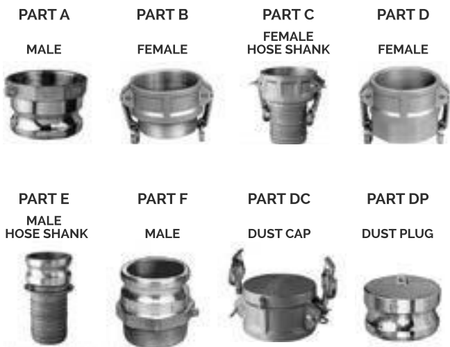
Male & female camlocks available with stub to couple with tubing sizes